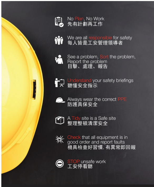
Safety Absolutes for use by Formosa 1