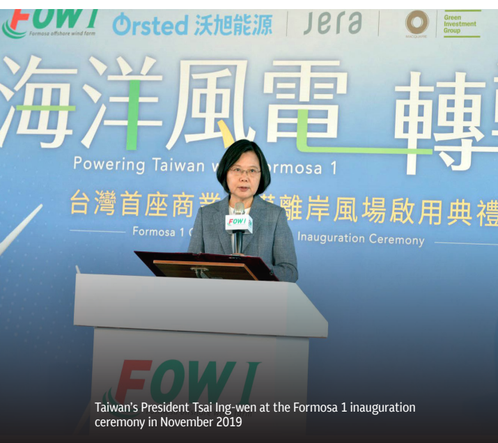
Taiwan's President Tsai Ing-wen at the Formosa 1 inauguration ceremony in November 2019