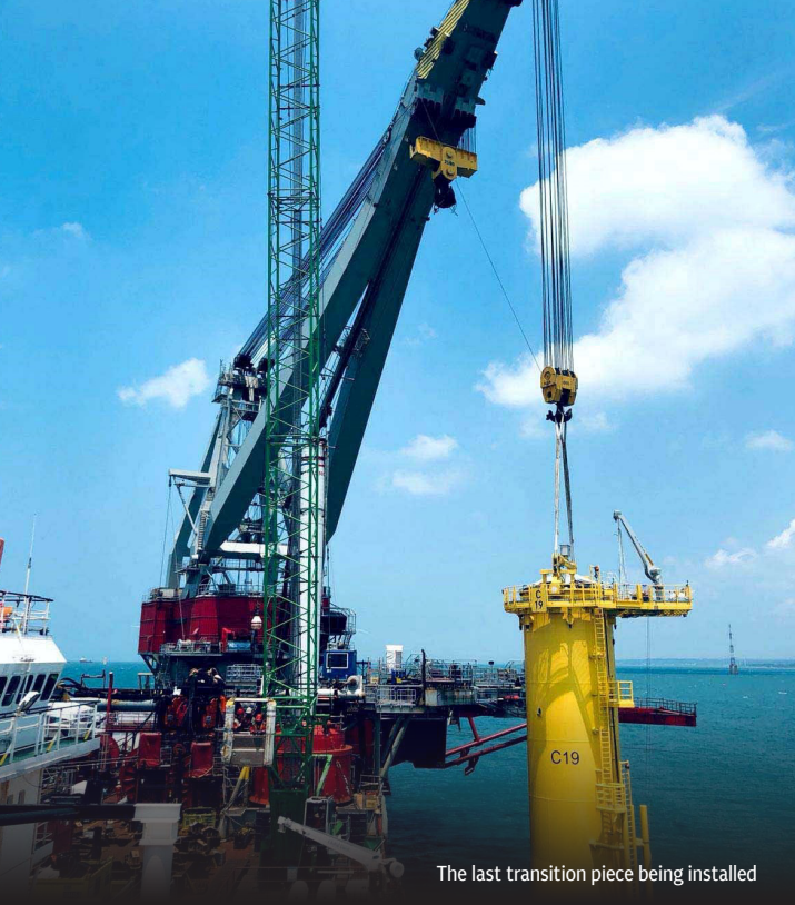
The last transition piece being installed