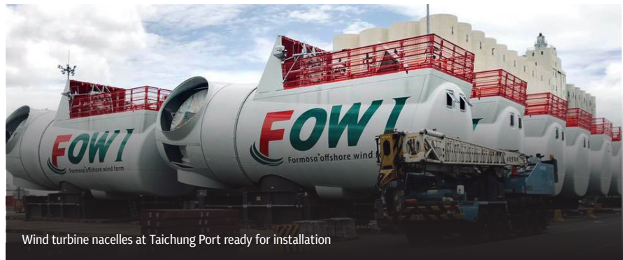
Wind turbine nacelles at Taichung Port ready for installation