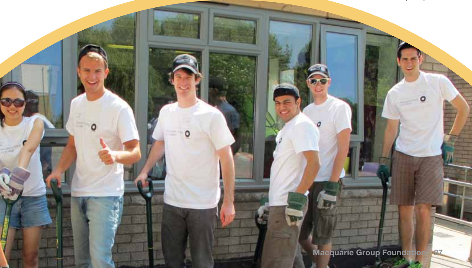
London interns help develop an allotment area for a local primary school