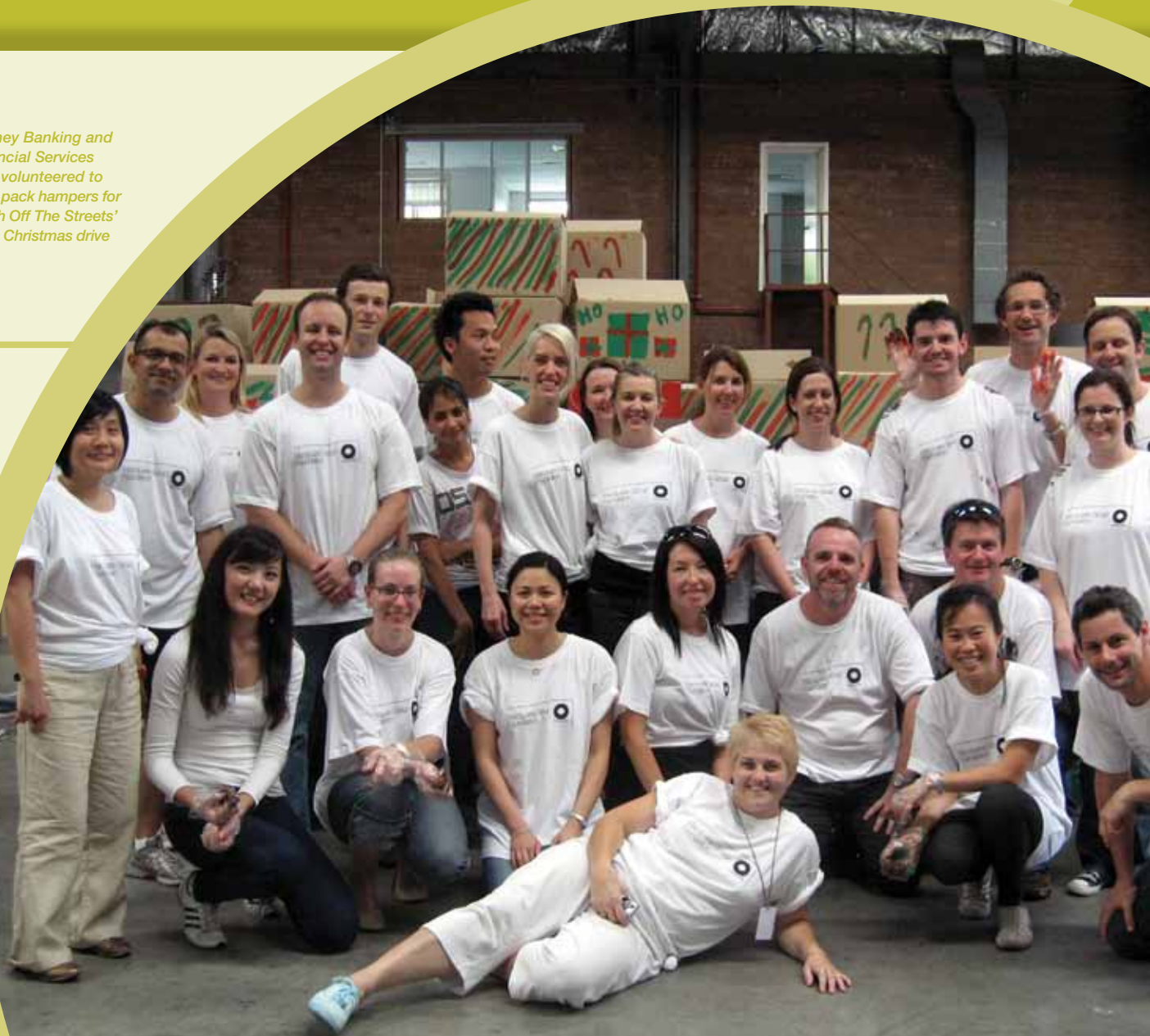
Sydney Banking and Financial Services staff volunteered to help pack hampers for Youth Off The Streets' 2010 Christmas drive