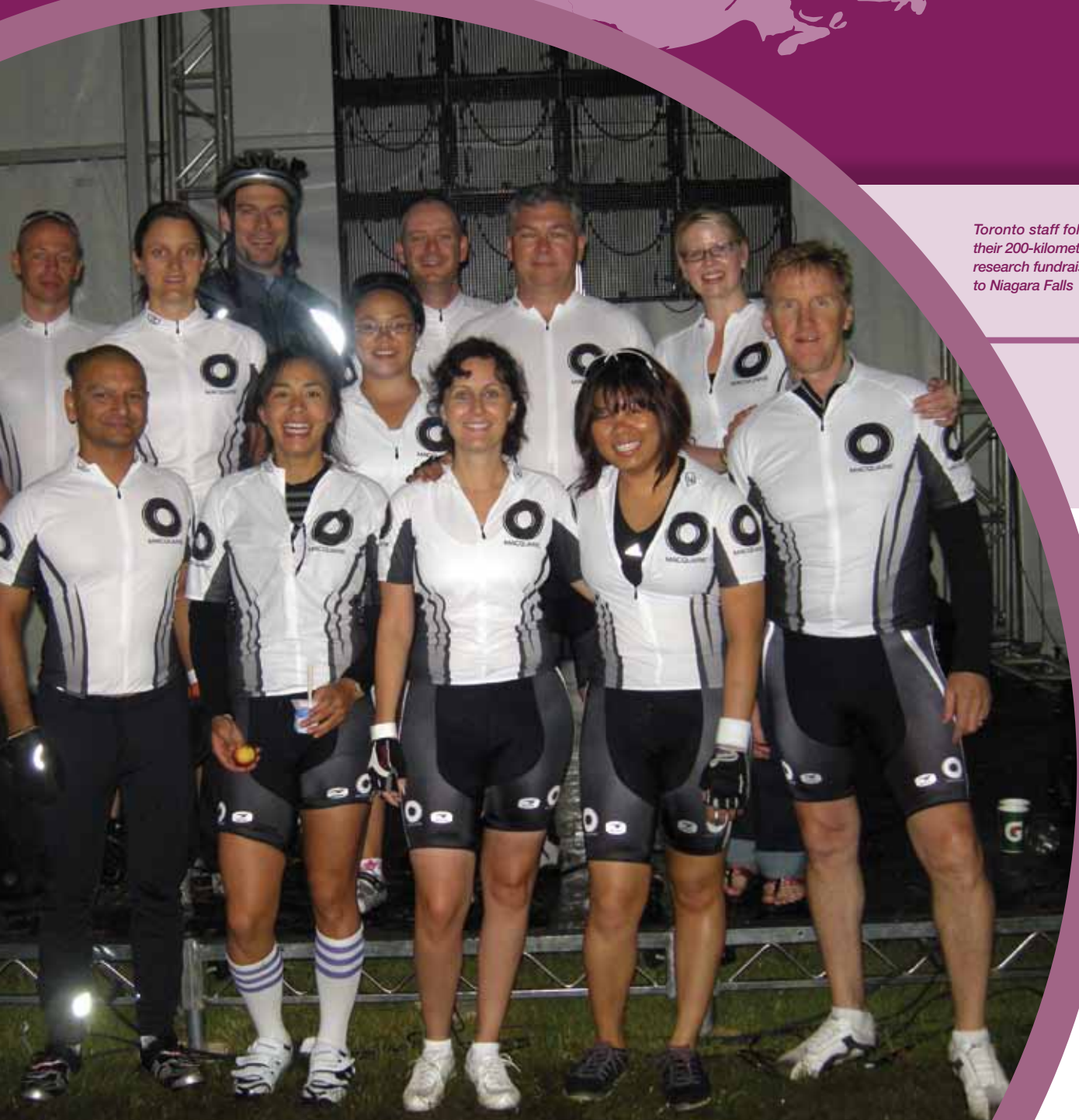
Toronto staff following their 200-kilometre cancer research fundraising ride to Niagara Falls