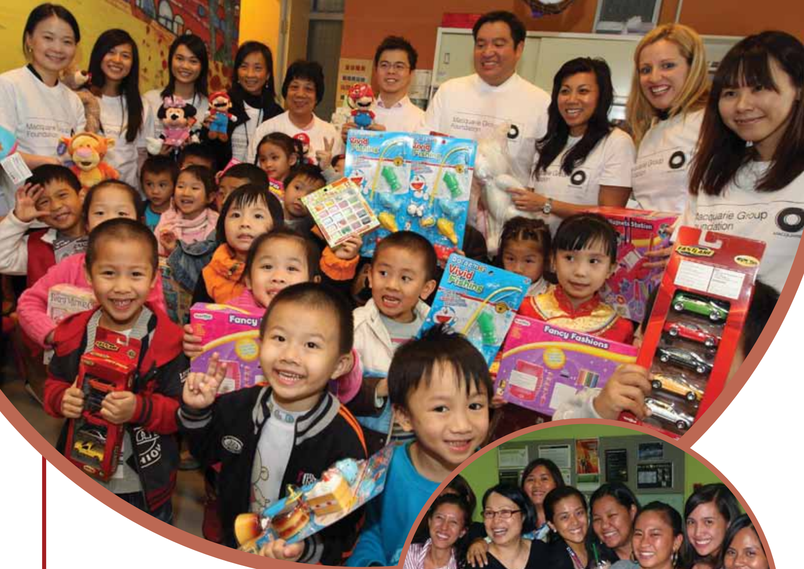
Manila staff staged a cook-off as part of a fundraiser for Hospicio de San Jose, a home for orphans, children with special needs and the elderly