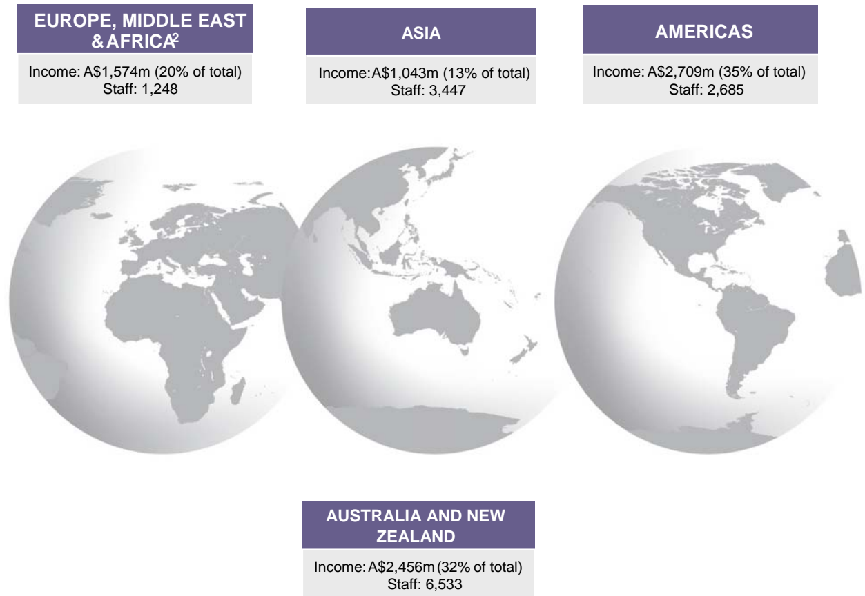
International income of MGL Group 1 by region for the year ended March 31, 2014

The chart below shows MGL Group's international income by region in the 2014 fiscal year.