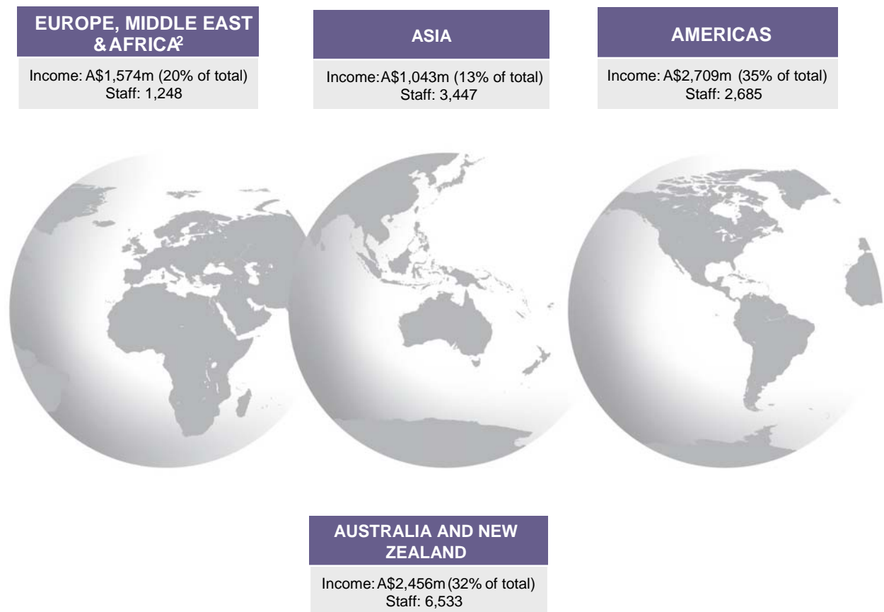
International income of MGL Group 1 by region for the year ended March 31, 2014

The chart below shows MGL Group's international income by region in the 2014 fiscal year.