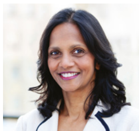
Shemara Wikramanayake CEO, Macquarie Group

Macquarie is fully invested in the success and growth of the UK economy.